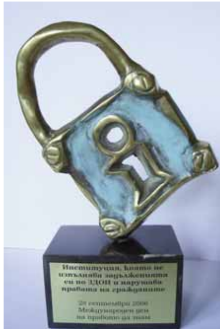
The Access to Information Programme Trophy

have made a significant contribution to free expression or in their use of the new legislation.