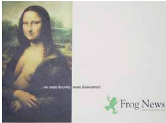
Fresco in the lobby of the Frog News office