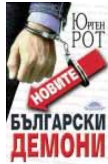
Cover of Jurgen Roth's book

components of the so-called grey economy fit together.