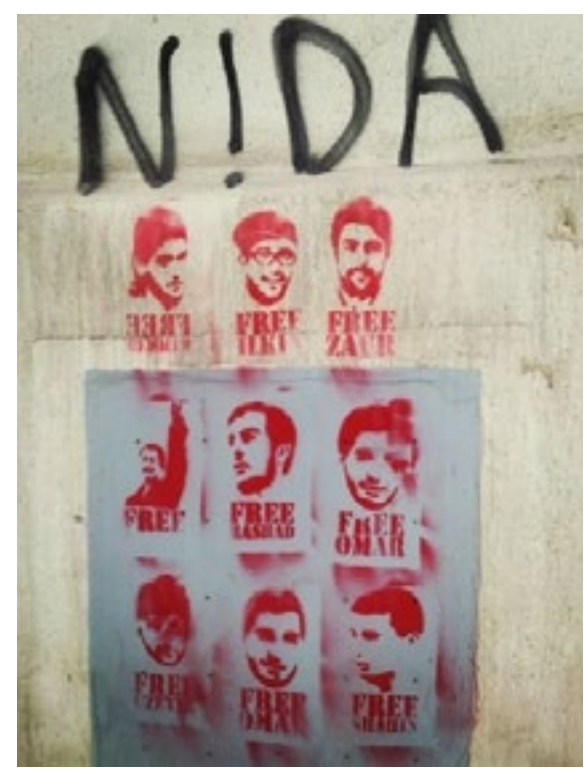
March 2014, wall in Baku

ARTICLE 19 is currently aware of up to 10 activists behind bars for organising or participating in protests.