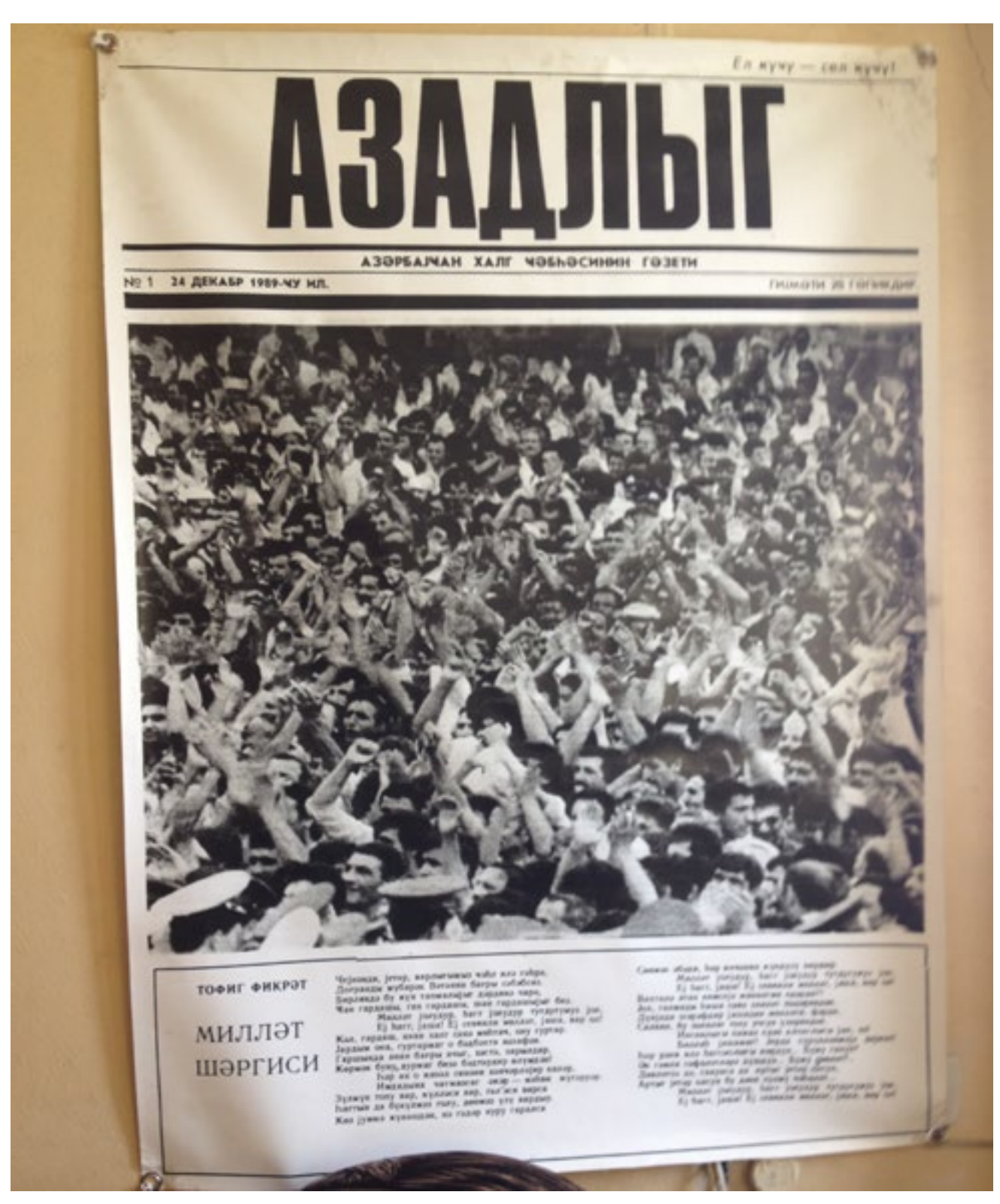
First page edition of Azadlyq (Freedom) newspaper 24 December 1989 @ARTICLE 19