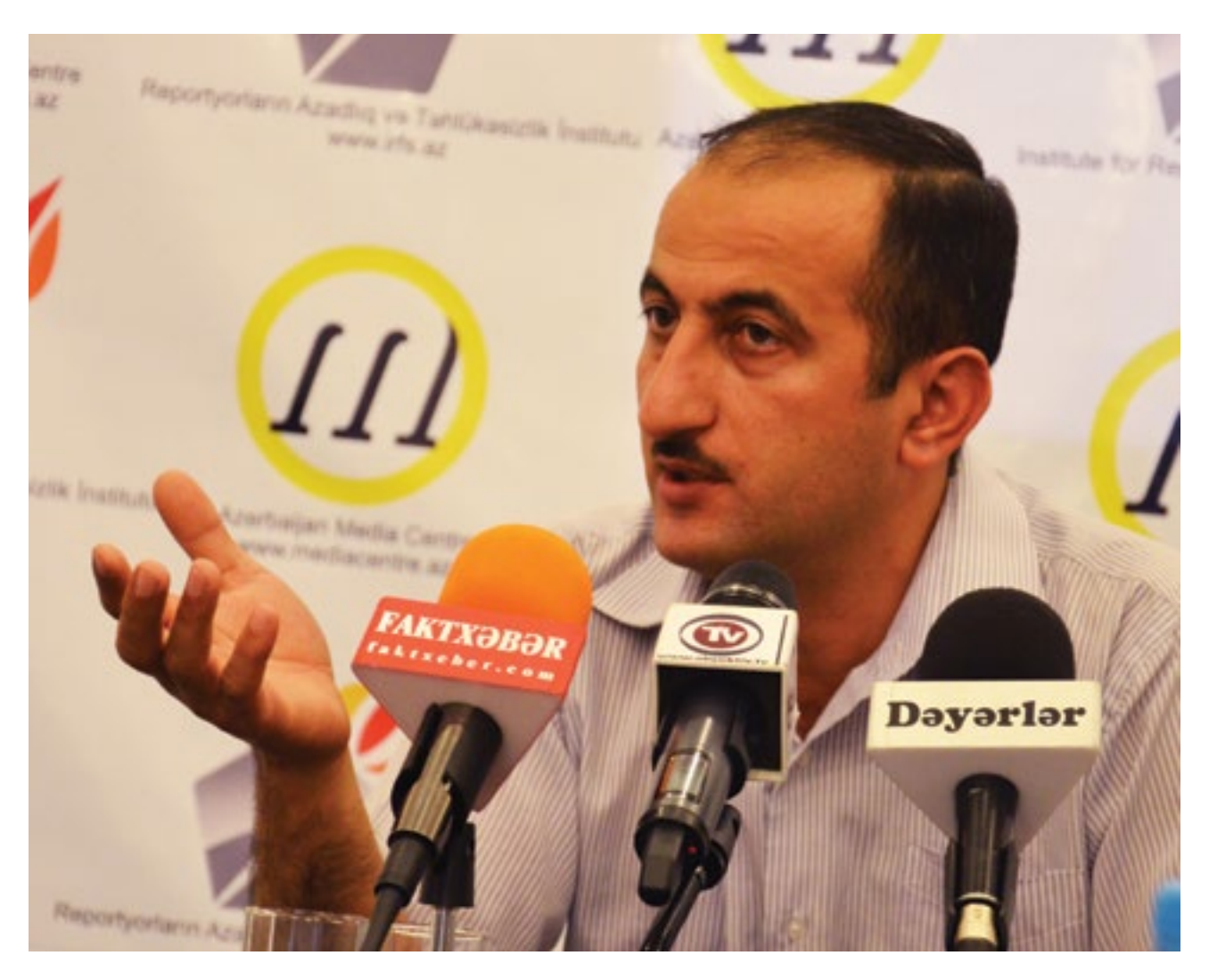
Idrak Abbasov