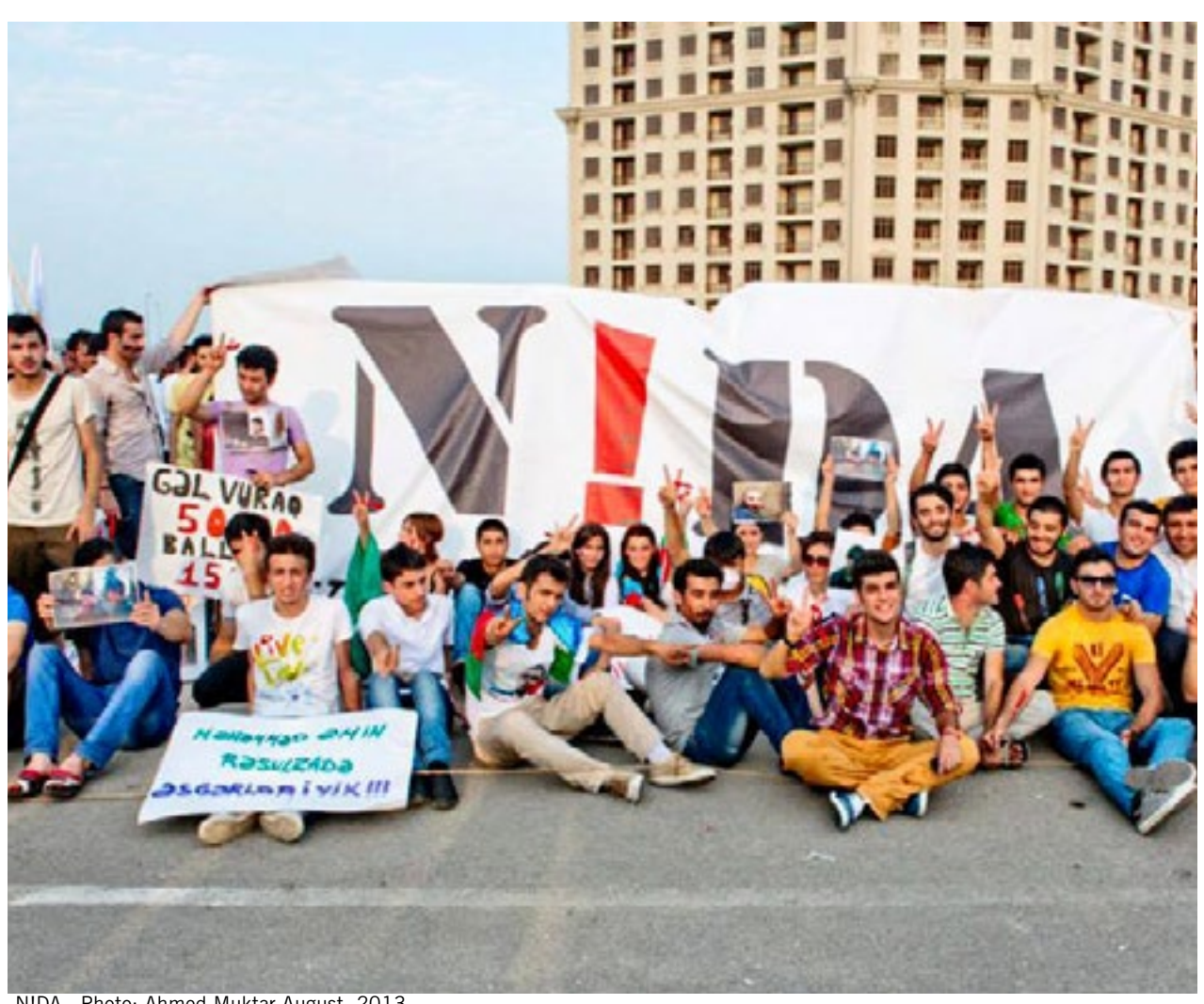
N!DA August, 2013