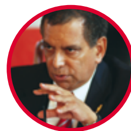
Fidel Herrera Beltrán

Various described as “ despicable ,” “ corrupt ” and “ Machiavellian ,” Fidel Herrera ruled Veracruz as governor from 2004 to 2010, leaving an unforgettable impression on all those who had anything to do with him. Observers say he made the criminal cartel known as Los Zetas welcome in Veracruz in the late 2000s (see box) and allowed an unprecedented climate of violence and persecution to develop, one in which journalists were specifically – but not exclusively – targeted.