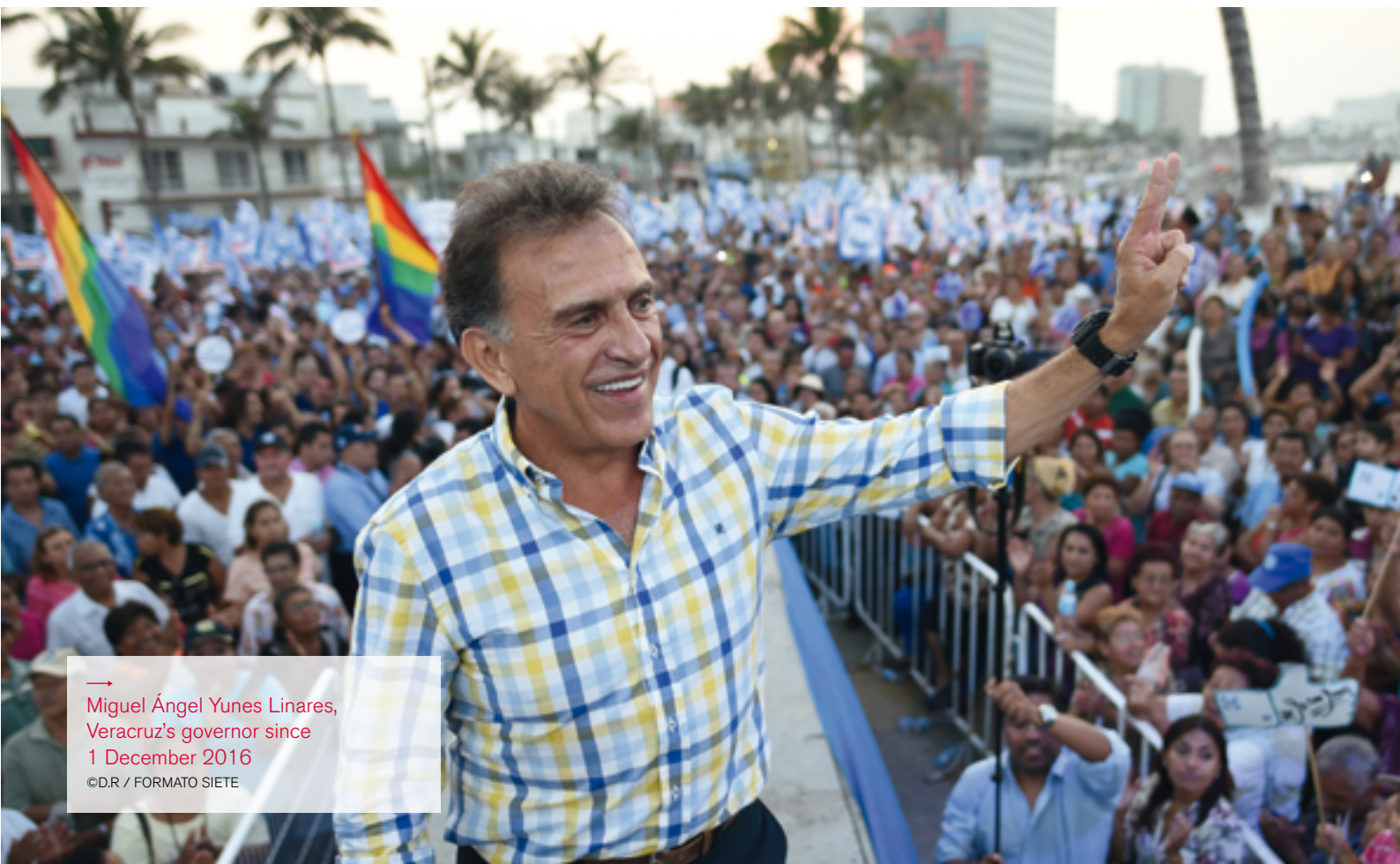
→ Miguel Ángel Yunes Linares, Veracruz's governor since 1 December 2016

Yunes nowadays seems to be trying at all costs to differentiate himself from his predecessor. Instead of threatening journalists and telling them to " behave ," as Duarte did in 2015, Yunes promised in one of his first post-election addresses that " a new effort will be made ensure that freedom of expression and journalists have all the guarantees envisaged in the Constitution, without any kind of interference in editorial policies. " He added: " Journalists will have our full support, they will be able to practice their profession freely, and Veracruz will no longer be the most dangerous place for this noble activity. " He also announced the creation of a "Truth Commission" to investigate the many disappearances of Veracruz residents in recent years. His promises are encouraging but seem ambitious, especially as he has only two years to get things done.