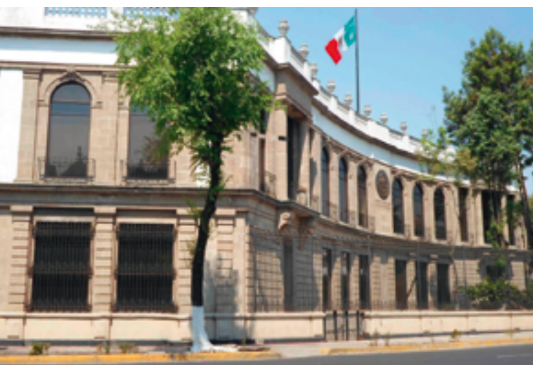
→ SEGOB (interior ministry) headquarters in Mexico City

Since 8 October 2013 – even before the FEADLE's prerogatives were expanded and incorporated into Mexico's constitution – civil society organizations that defend journalists have been calling for crimes against the media to be investigated at the federal level and for the federal justice system to have sole decision-making authority over such cases, so that they are handled in a more neutral manner. This request has so far been ignored and has yet to be added to the agenda of the Mexican Congress for discussion.