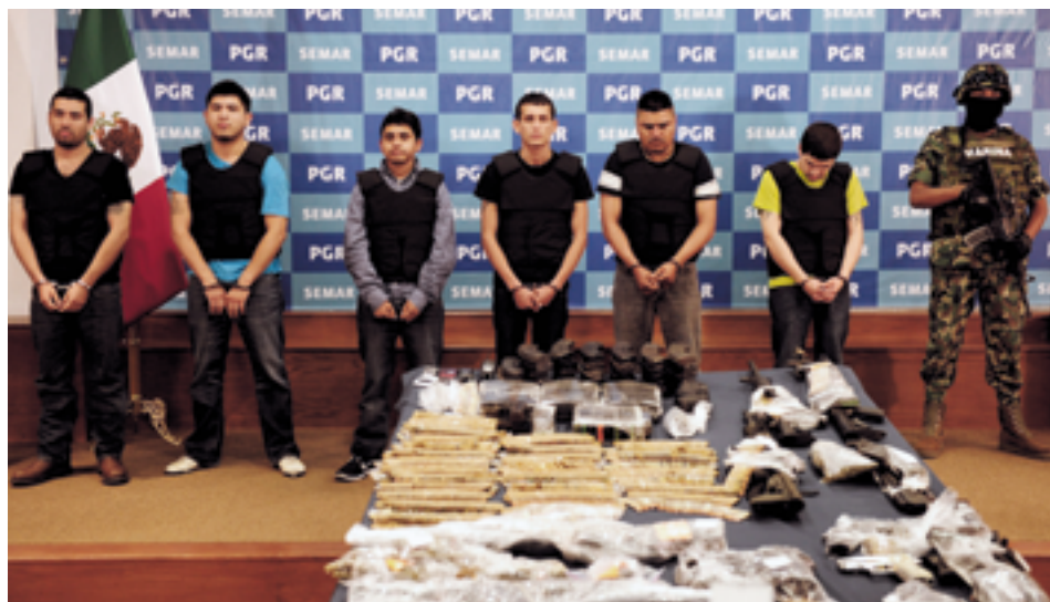
→ 8 October 2012: Arrest of members of the Los Zetas cartel in Mexico City