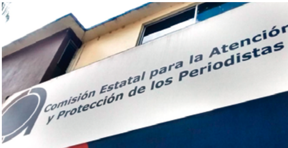
→ CEAPP headquarters in Xalapa, Veracruz