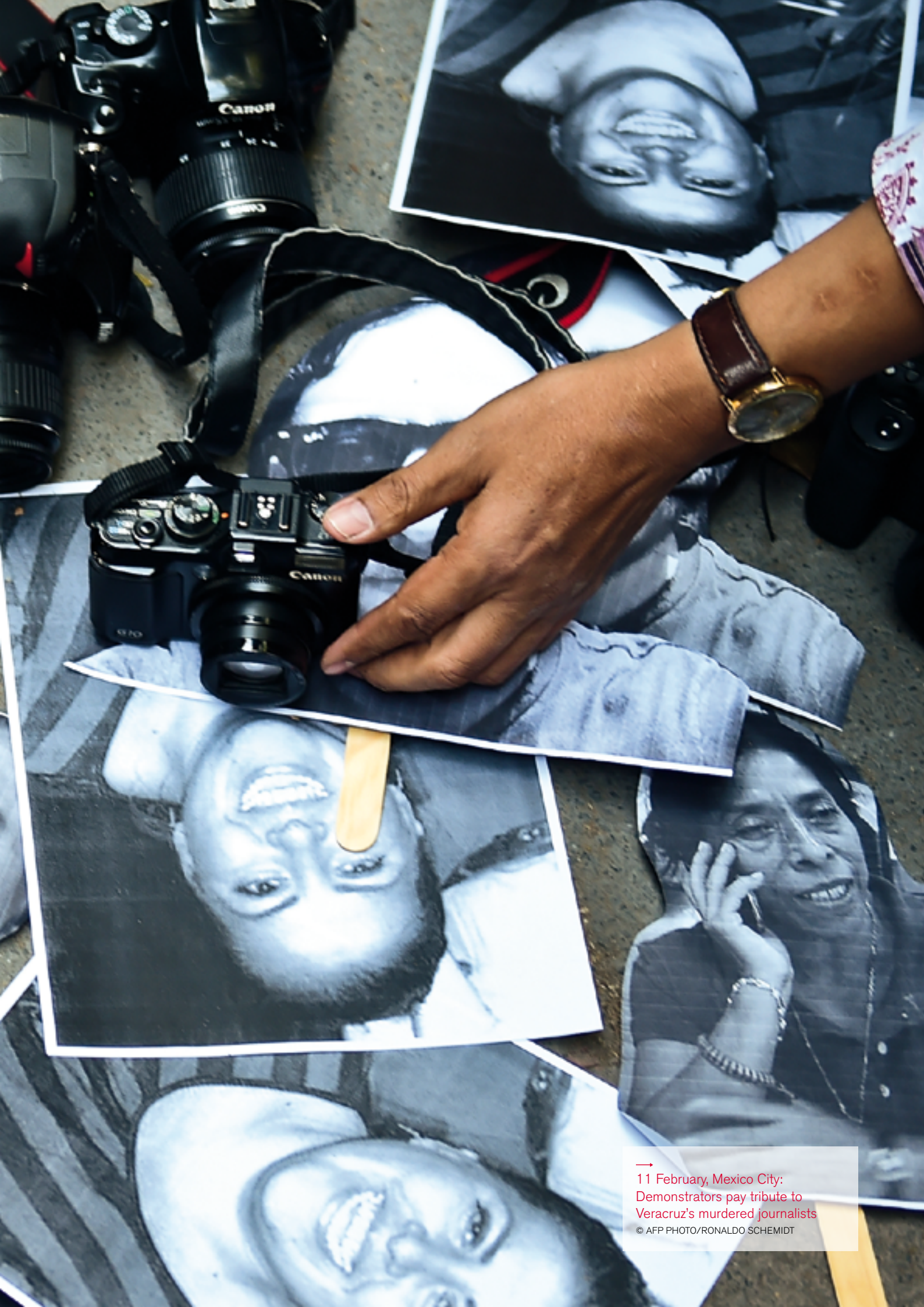
→ 11 February, Mexico City: Demonstrators pay tribute to Veracruz's murdered journalists